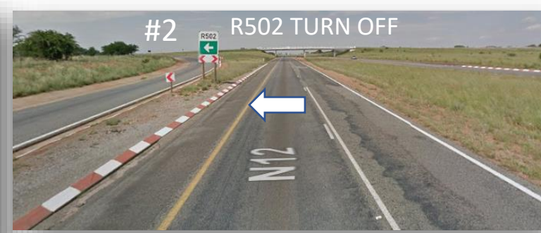
#2 R502 TURN OFF