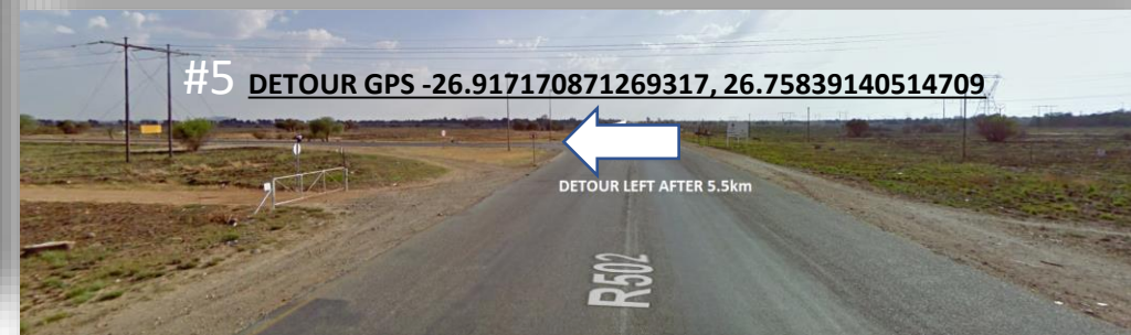
#5 DETOUR GPS -26.917170871269317, 26.75839140514709