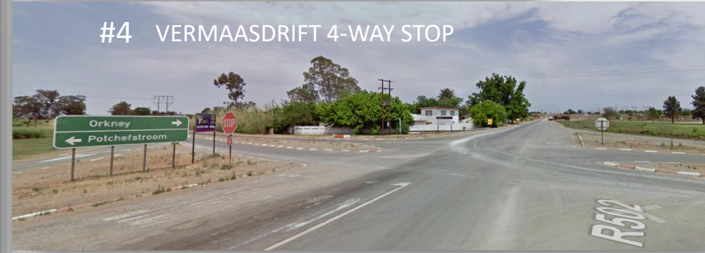
#4 VERMAASDRIFT 4-WAY STOP